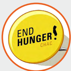
California Hunger Action Coalition