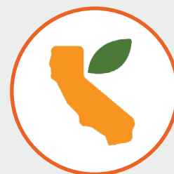
California Food and Farming Network