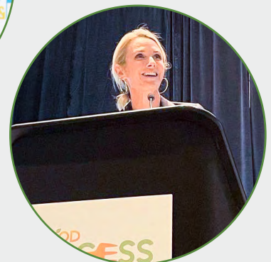
Jennifer Siebel Newsom First Partner of California