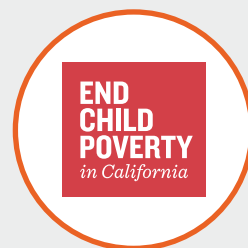
End Child Poverty California