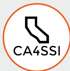
Californians for SSI